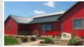
Farmsteads - Farm Tours