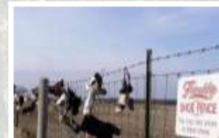
Friendship Shoe Fence - Cornell