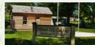
Civil War Historic Home - Saunemin

Livingston Co. nestled between Bloomington, Champaign, Peoria & Joliet