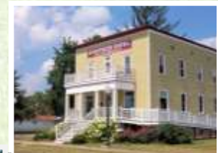
Hampshire Hotel - Forrest

Historic Route 66 Museums & Attractions Dwight, Odell, & Pontiac