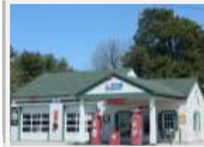
Historic Texaco Station - Dwight